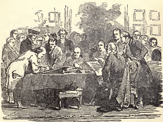
Signing the Declaration of Independence.